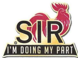
The I'm Doing My Part Lapel Pin

Note: if the recipient of a Distinguished Service Award is later awarded a Branch HLM Award the DSA shall no longer count towards that allowed for the Branch as the HLM supersedes that of the DSA. However, if a recipient of an HLM is later awarded a Branch DSA that DSA shall count towards that allowed for the Branch as this represents additional contributions above and beyond that which was previously earned for the HLM.