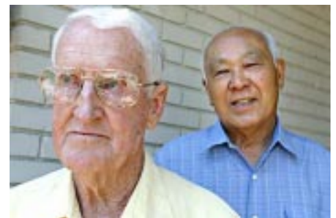
Westgate Branch 125...