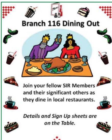
Image posters to promote Activities can be ordered online from Costco to use at the luncheon sign-in area ...try gluing them on a poster board to add color to your luncheon sign-in area. The couples activity poster – shown below from Phil Goff of Branch 116 in

Walnut Creek— has from 40 to 60 at each outing ...ask me for a poster instruction document. It is easy to add couples activities. The full list can be viewed in the Public Relations section on the SIR website: sirinc.org.