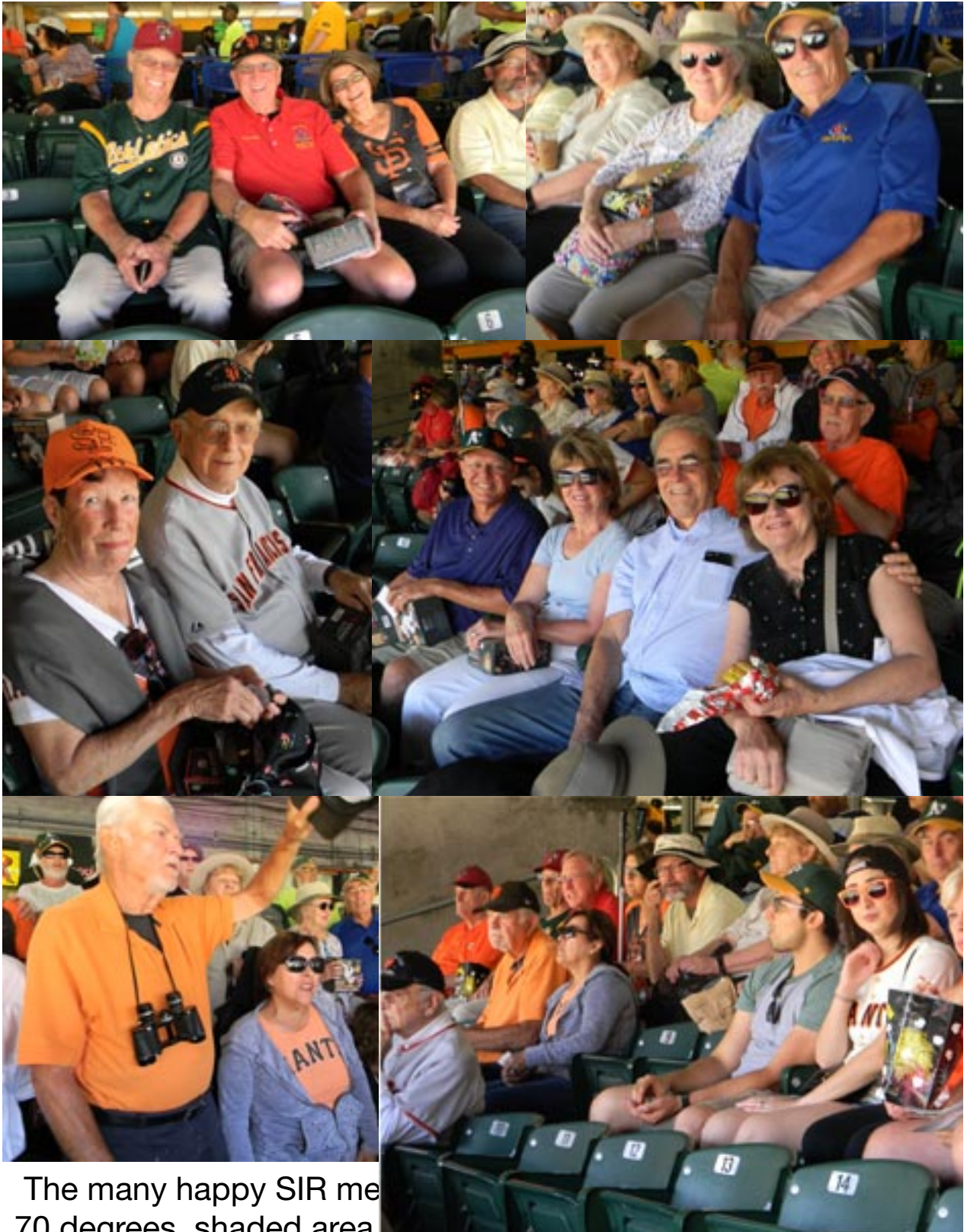
The many happy SIR members at the game. The temperature was in the 70 degrees, shaded area, free beer on hand, autographs and gem plays on the field.