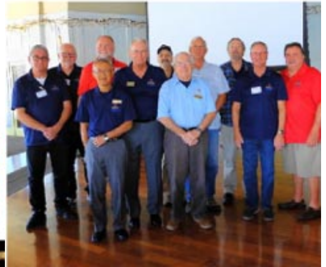
Branch 170 Holiday Dinner and new Officers.