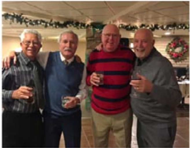
Motley crew of Branch 59 Bowlers—(Needed a photo to fill the space)