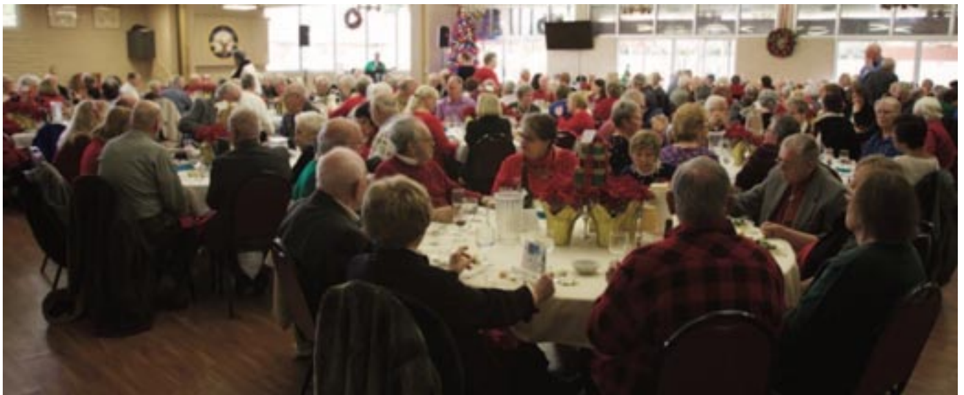
Branch 59, Fremont Holiday Luncheon