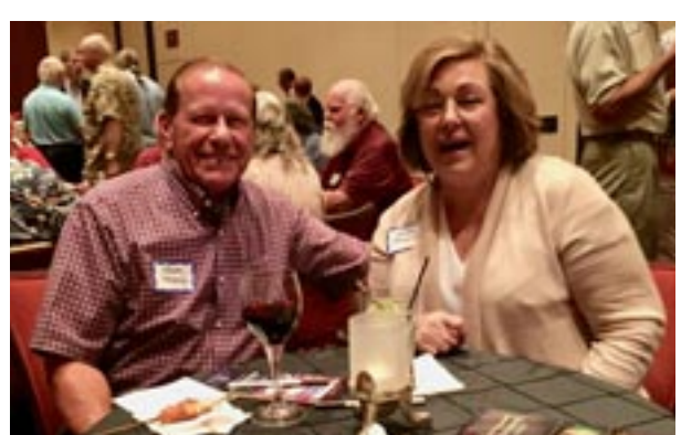
Social Gathering-3 61st State SIR Annual Meeting