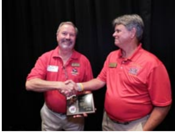
Region 1-Area 1 Bidwell Branch 110